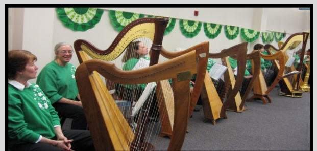
A Gathering of Harpists at our Celtic Ceilidh.

You can access the online calendar on our website from home. We'd be happy to keep you up to date with our library news by email. Just email us at info@bville.lib.ny.us to sign up.