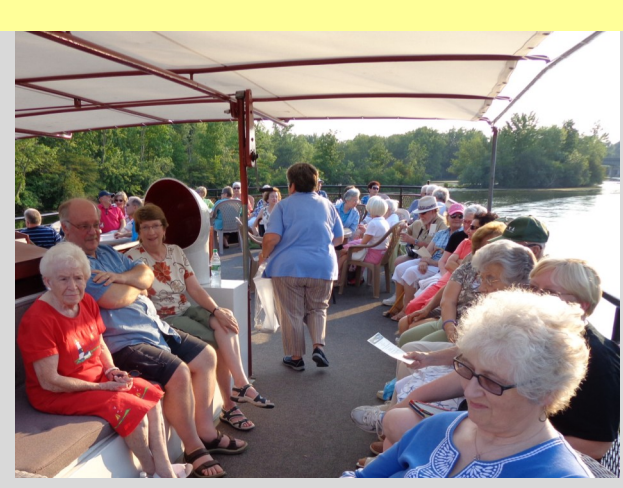
Our Seneca River Boat Cruise, a popular annual fundraiser for the library.

Please note: This grant provided services to the community beyond those that could be offered through the BPL.