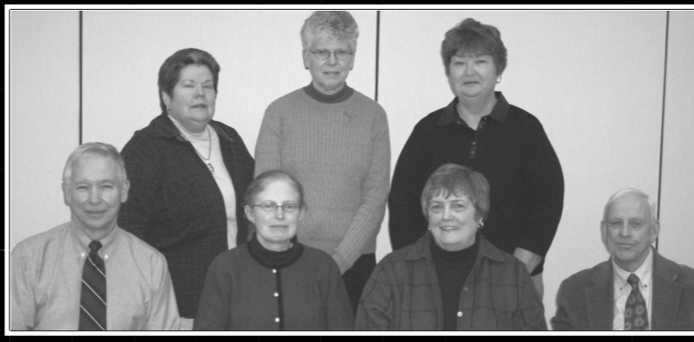
The Baldwinsville Public Library Board of Trustees

The Baldwinsville Public Library was established in 1948 and today serves as a community center for life-long learning, an economic engine for job seekers and small business entrepreneurs and a meeting site for numerous community organizations and groups.