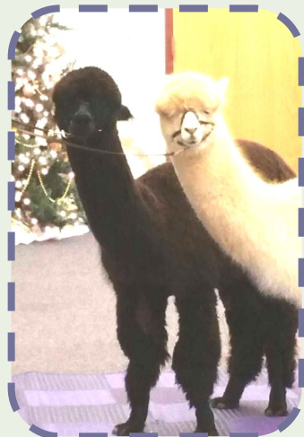
The Girls of Dinglehole Road

Active Library Card Users: 18,235 Total Attendance: 255,649 Attendance at Programs: 13,437 Collection Size: 174,253 Items Checked Out: 372,353 Public Computer Users: 14,221 Website Visits: 94,760 WiFi Sessions: 187,824 Questions Answered: 18,049 Hours Open Yearly: 3,270