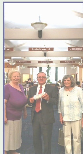
Thanks to the NYS Legislature for Library Construction Funds which enabled us to purchase energy saving LED lights!