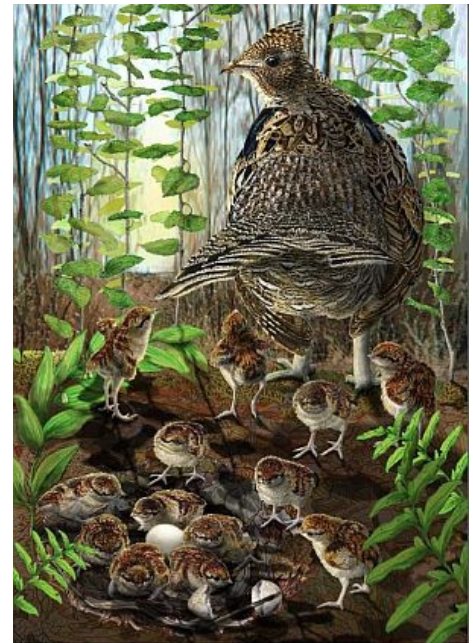
The Ruffed Grouse

http://projects.nytimes.com/census/2010/explorer http://blogs.cornell.edu/horticulture/