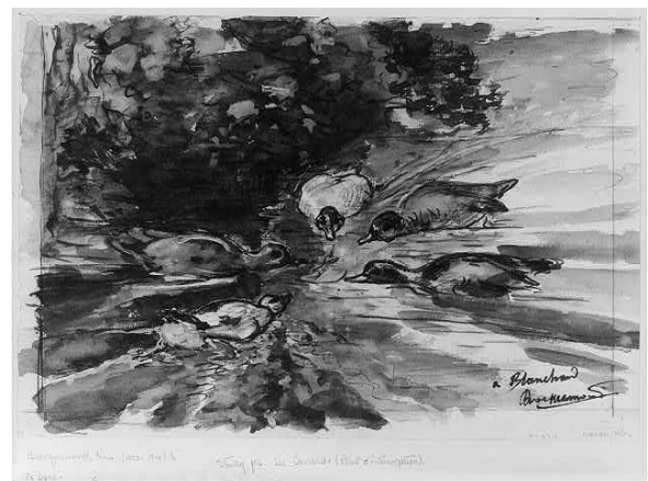
The drawing Les Canards , by Felix Bracquemond.